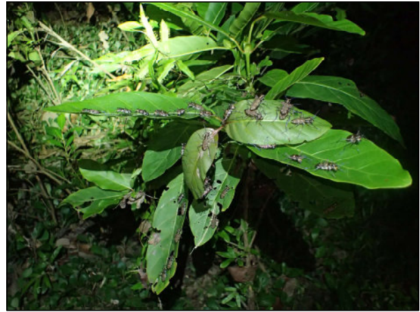
Fig. 2 Calochroa carissima roosting at night in large numbers on low vegetation.

sunny sand bars fringing the Mekong and along the small sandy (1–2 meters wide) edges of a shaded dipterocarp forest river close to BC4. The species is a powerful flyer and difficult to catch during the day. At night, it aggregates on low vegetation about one meter above ground level along these sandy ridges in large numbers, with sometimes over 100 individuals on a single plant (Fig. 2) and can then easily be collected. Tiger beetles from sandy edges of rivers are known to roost on low vegetation at night to avoid predation (Pearson & Anderson, 1985; Bhargav & Uniyal, 2008). Calochroa carissima is known from southern Laos mostly along the Mekong, and it is expected to occur all along the Mekong River and its tributaries.