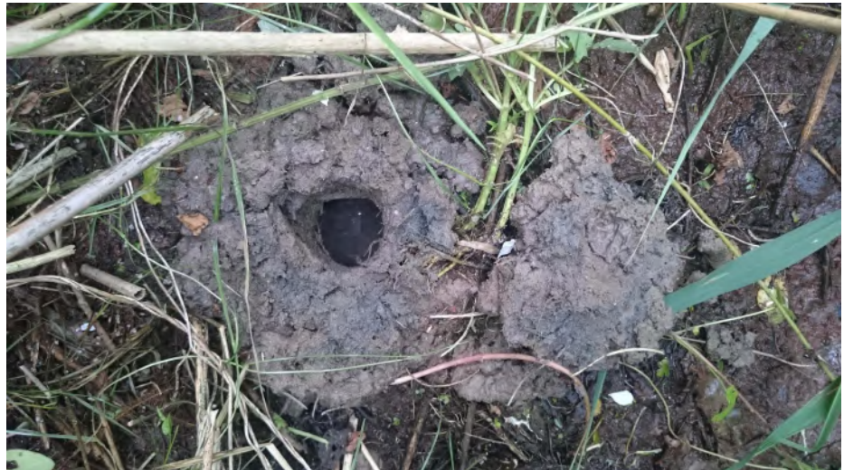
Figure 3. Underground burrow (with top of chimney removed for inside view) at the site near Verrebroek. In this burrow, one subadult female of Procambarus cf. acutus acutus was collected.