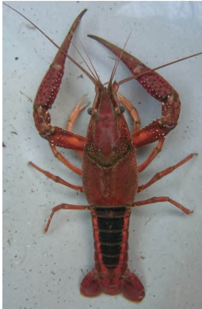
Figure 1. Male specimen of Procambarus acutus acutus (Girard, 1852) collected at the site near Verrebroek.